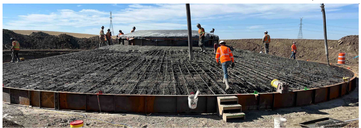
T7 Foundation Concrete Pour // Alberta